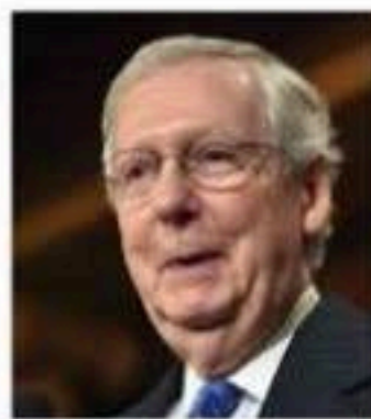
schmuck ("the part of the male anatomy discarded following circumcision")