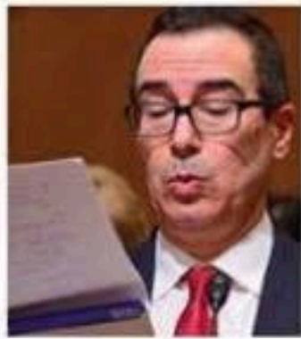
ganef (thief; phony)