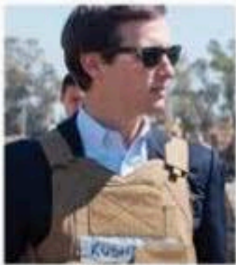
nebbish ("of no substance")