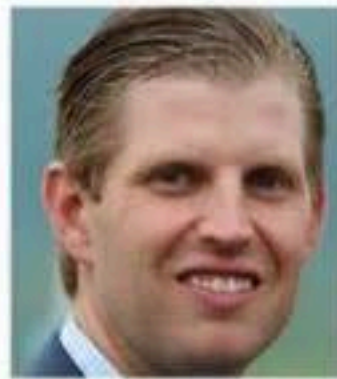
pisher (a little boy)