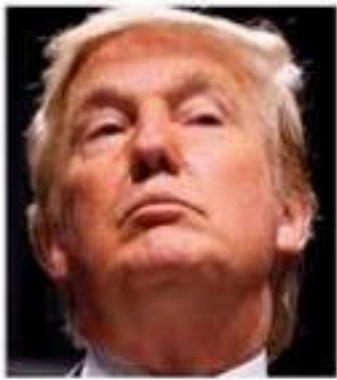
chazer (pig; vulgarian)